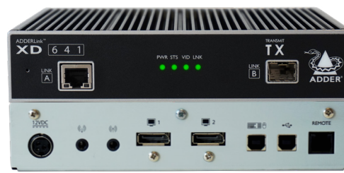
ADDERLink XD641 TX - Front & Rear