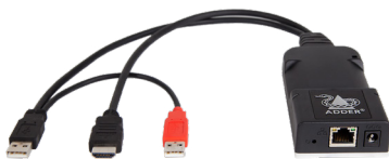
ADDERLink INFINITY 101T - HDMI